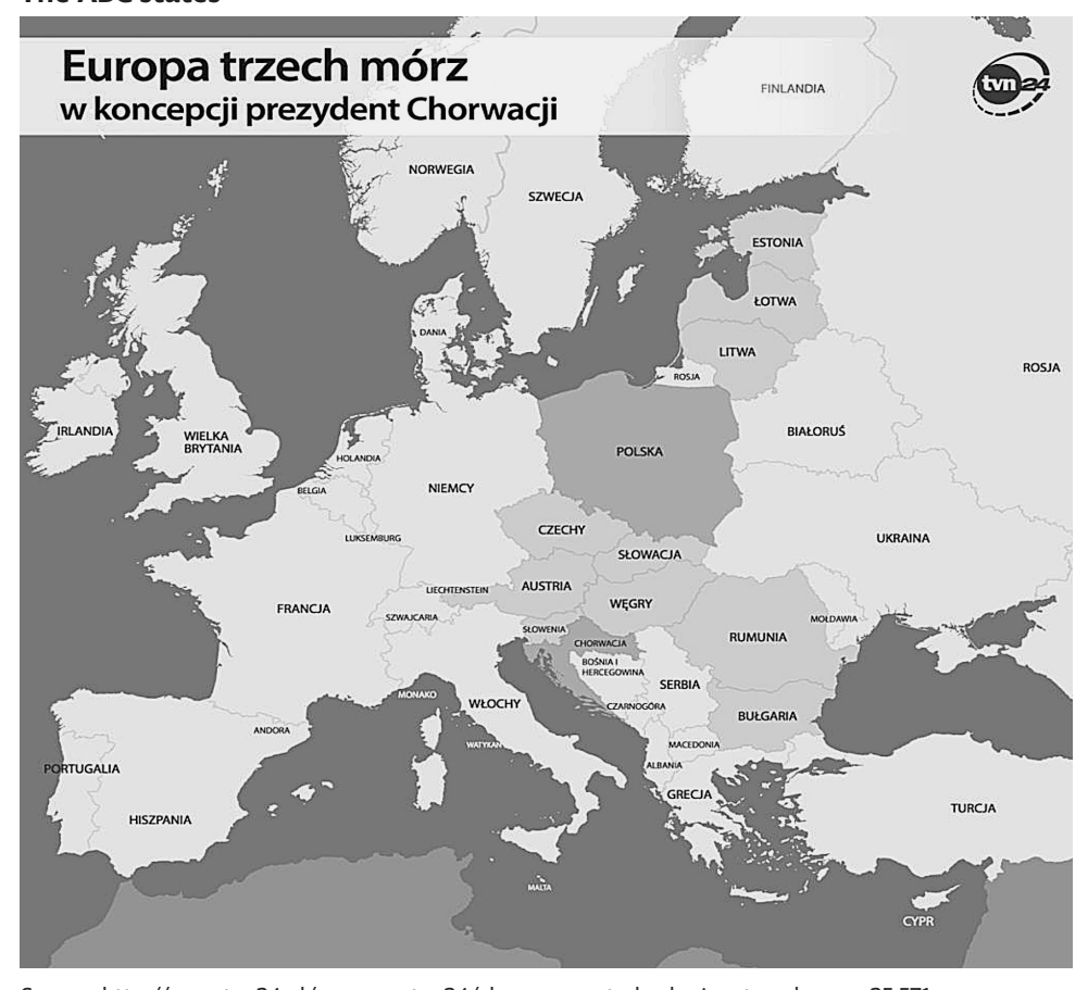
The ABC states