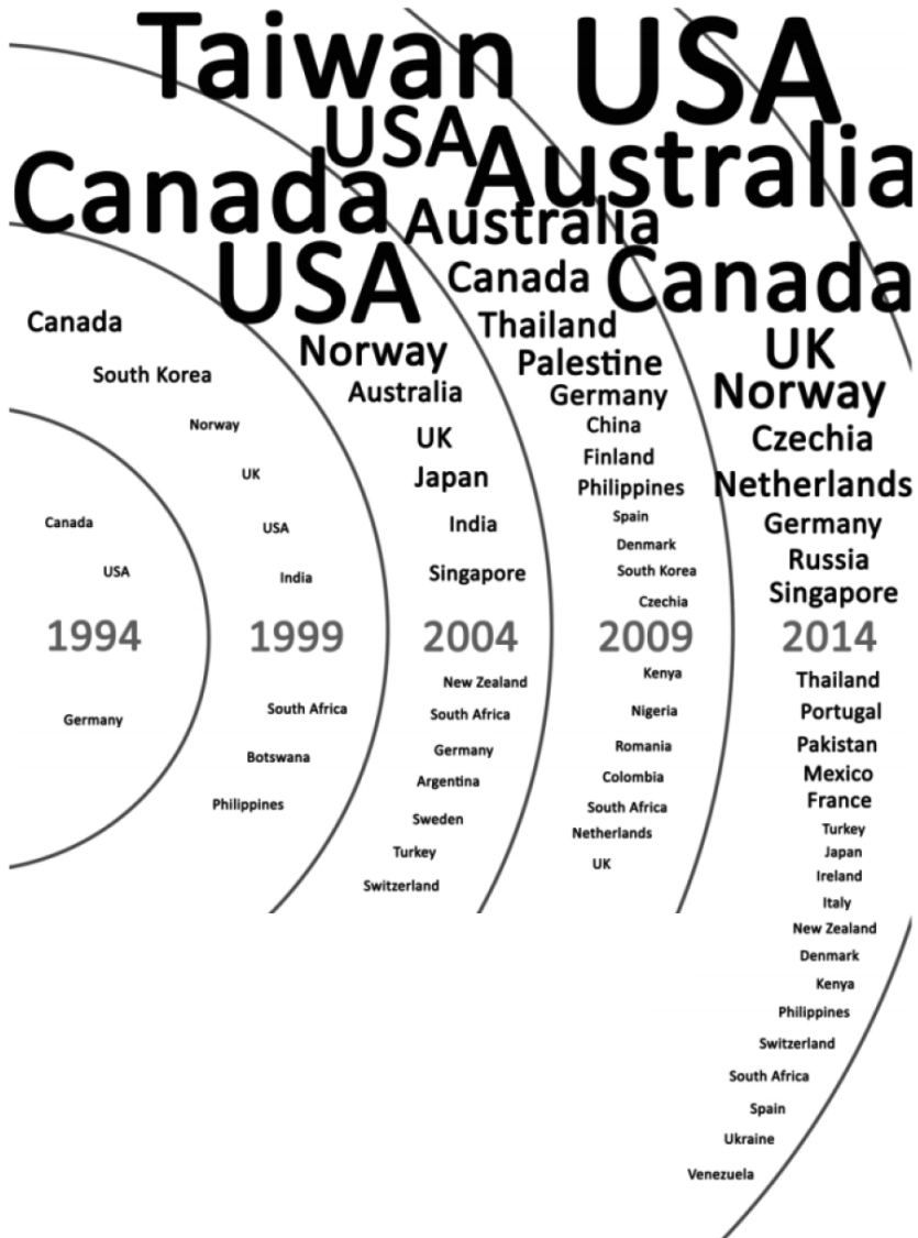
Picture 2: The development of the geographic distribution of authors writing on human security